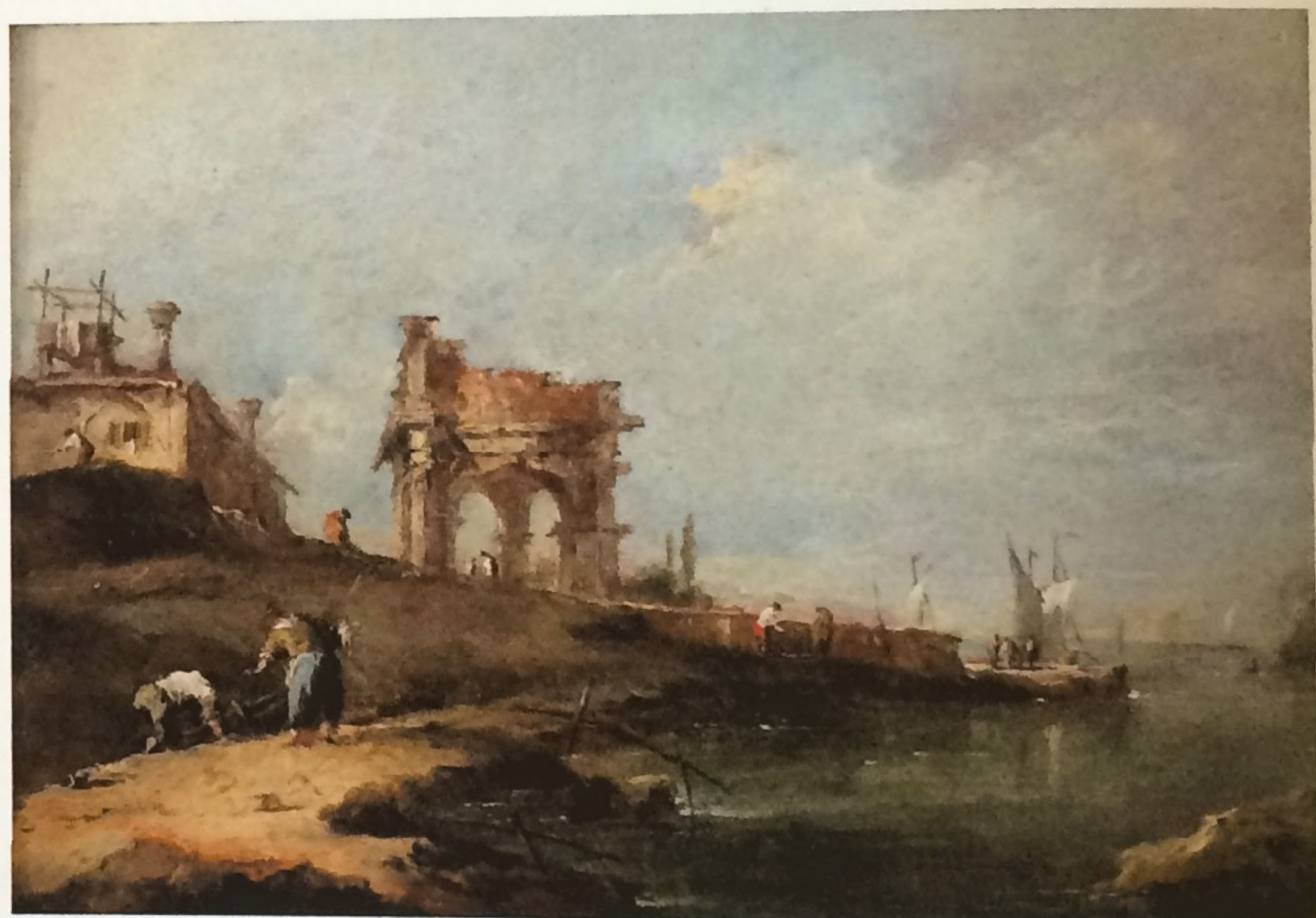
A capriccio of a ruined classical portico and a villa by the Venetian lagoon , by Francesco Guardi (1712-92). Inscribed and dated verso 'pour le chev. de Thomon Officier Au Garde Suisse / 1780'. Oil on panel, 18 by 25.2 cm. CHARLES BEDDINGTON LTD, LONDON